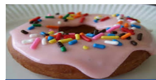
Being offer this

“Here’s the thing,” says Paul in vs. 9 , these guys “ will not get very far ”. What do you think he means by that? Well, he means that although they were having some success at presenting themselves as an alternative to apostolic teaching, eventually people would figure them out, and they would go from on top of the heap to the bottom! When people finally saw behind their act, they would be disgraced, and their fall from favor would be precipitous! It’s like they live for right now and cannot see their impending downfall. We’ve more recently had a number of famous Christian writers and pastors of mega-churches failing dismally when how they have been conducting themselves behind the scenes finally is revealed! How is it revealed? How else? It is when their victims begin to come forward and tell their stories of abuse and misuse at the hands of these monstrous, two-faced men or women! And, true to form, they will somehow blame everyone else except themselves! This only adds to the realization by the people in the church as to what they really are! Even with being well-versed in human nature, I am shocked, though, how gullible people can be! Gullibility allows this kind of thing to continue for many long years when it should have been uncovered and stopped at the beginning!