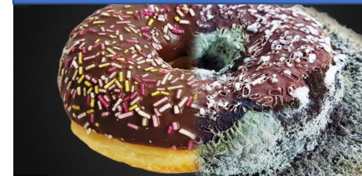
Seeing it for what it is!

Here’s the thing. People are hesitant to do or say anything because they have seen others confront their leaders and be wrong. They perceive that people attacked their leader(s) because they were filled with bitterness and anger. All they had on the guy, basically, was that they had had a disagreement and they didn’t get their way, or they imagined they had been disrespected, and so on. It was personal! And accusations are tossed about, and a gossip campaign gets started and factions are formed as people take one side or the other, and churches are destroyed, and Satan wins! *It is something like a dirty, rotten, lying, slanderous, political campaigns on TV these days – and who wants to get involved with something like that! You feel like you have just been slimed! So, in a church, good people fail to take initiative, and nothing is confronted or corrected - and the destruction persists! Again, it is the victims that finally get the ball rolling, and out they march, one by one, forming a line of them – and a clear pattern emerges. I guess that is how it has to be unless the victim-izers are caught in the act!